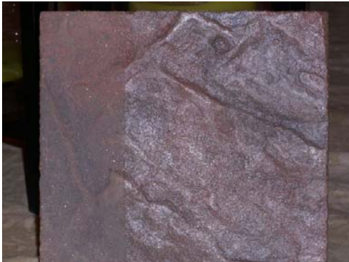
Stamped Concrete (Left: Gloss ; Right: Matte)